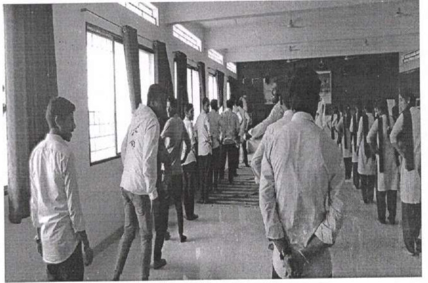
Students are performing the yoga.