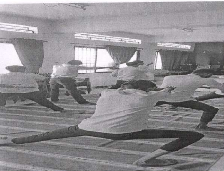
Students are in yoga pose on yoga day programme